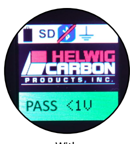
With BPK protection

Helwig Carbon's Patented BPK-Probe<sup>™</sup> is equipped with a micro SD card for internal test result storage and a BNC cable output to be used with the included oscilloscope. This high-quality tablet oscilloscope will allow a user to record and save the test results. The graphic visual is a powerful tool when promoting bearing protection to customers.