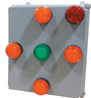
Intelli-Lift provides visual identification of a misaligned load.