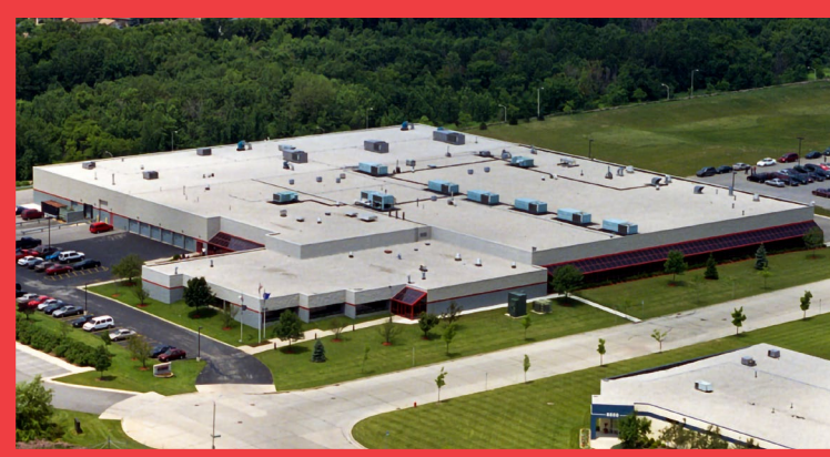
130,000 sq foot Corporate and Manufacturing Facility